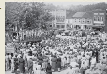
A World War II rally on the Public Square.