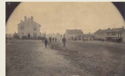
The Public Square, ca. 1890. The Old Courthouse is to the left.