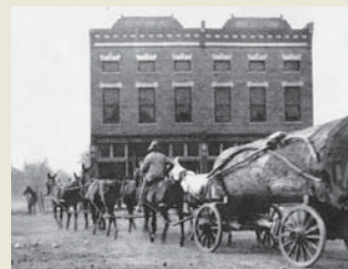
Main Street, ca. 1900.