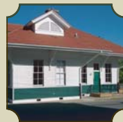
The Greensburg National Register Historic District is composed of 47 contributing properties, covers 15 acres, and includes "the Oldest Courthouse West of the Alleghenies" (1804), The Woodson Lewis Building (1900), and the Old Depot (1913).