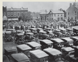
The Public Square, ca. 1925. The Old Courthouse is on the right.